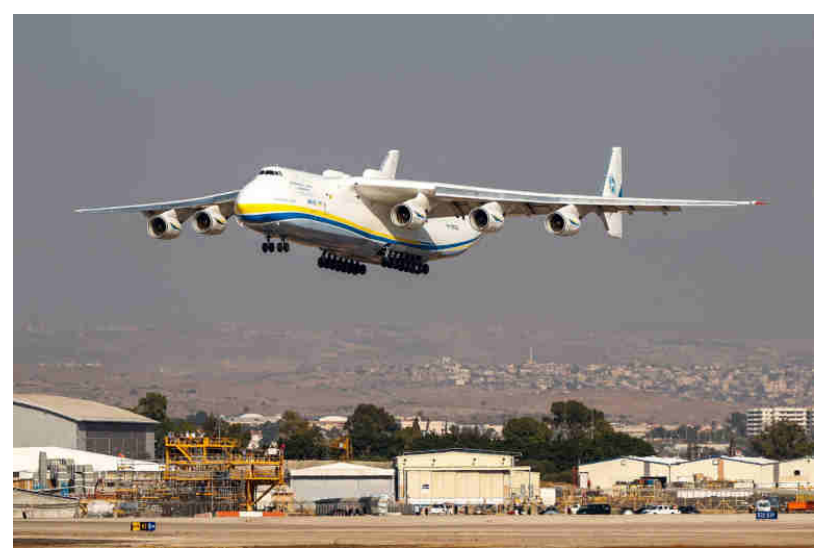
Ukrainian cargo plane Antonov-225

follow this link , it is here, vindt u deze hier